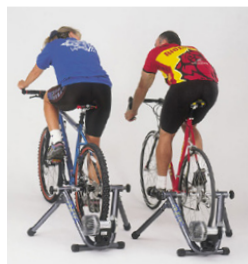
KINETIC IS BORN The Road Machine

Fast-forward almost 17 years: Kinetic trainer sales are stronger than ever and the brand is sought after by professional and serious enthusiast cyclists as the leading name in modern high performance cycling trainers.